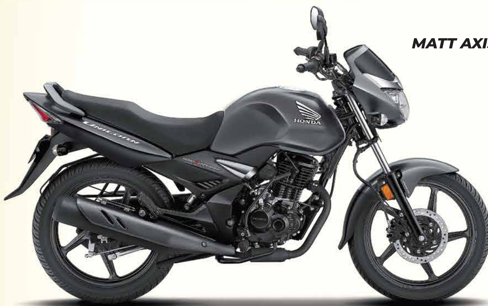
MATT AXIS GREY METALLIC