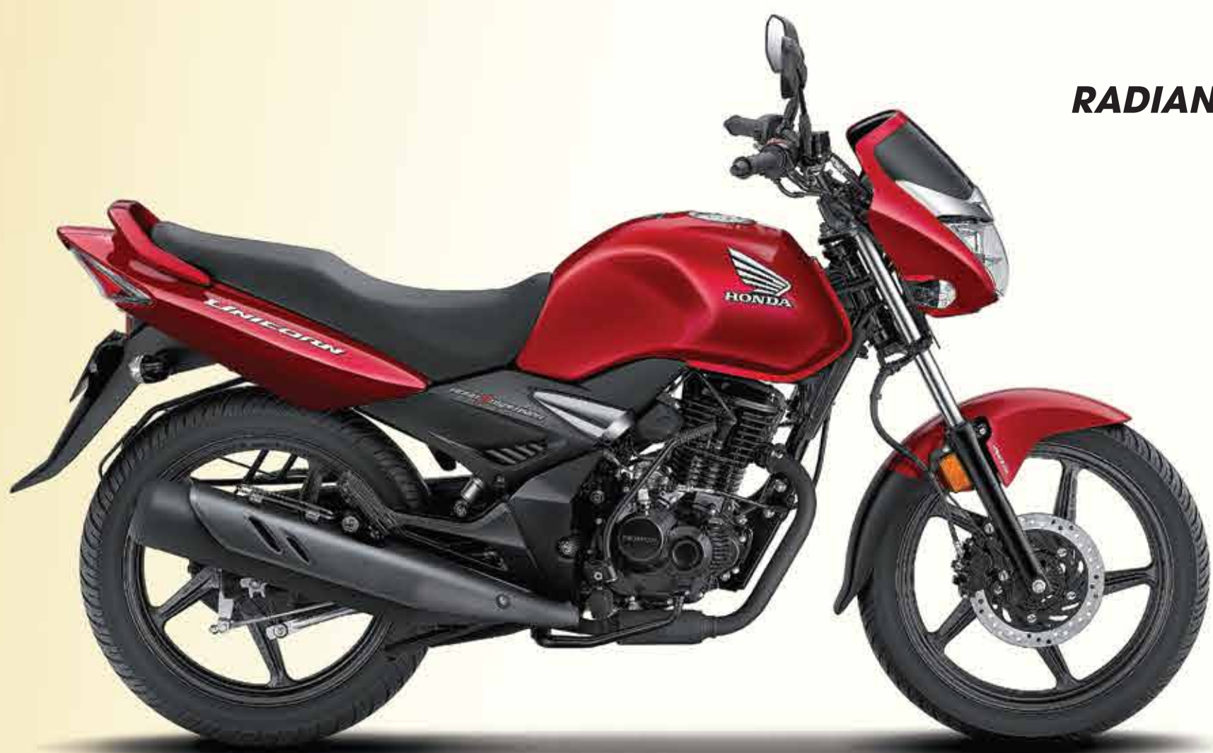
RADIANT RED METALLIC